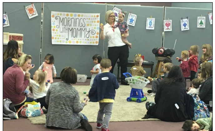
Our "Mornings with Mommy" sessions are enjoying getting to know about 15-20 children aged 0-4 at the four monthly sessions